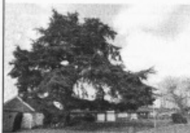
The Cedar of Lebanon - Lynceley Grange

The District Council have produced a wonderful book of all the 50 winning trees, which you can receive from the